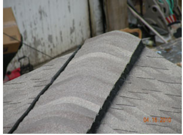
Hip Ridge Vent shingled-over.

Cap shingles installed over the Hip Ridge ' ShingleVent II ridge vent intersection.